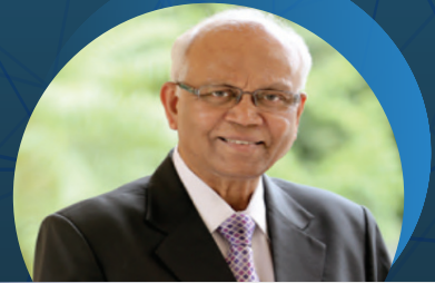
Dr. Raghunath Maselkar Padma-Vibhushan

Former Director General of CSIR addressed VSITians on “Building India as a Science, Technology and Innovation Superpower”