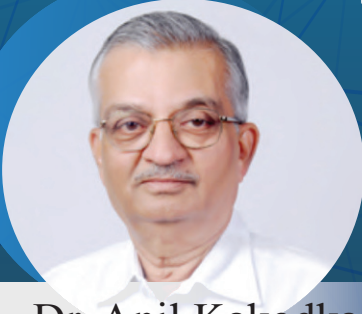
Dr. Anil Kakodkar Padma-Vibhushan

Indian Nuclear Physicist addressed VSI-Tians on “Taking India Forward Role of Educational Institutes”