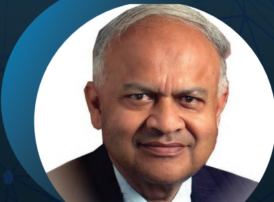
Dr. Jayant Narlikar Padma-Vibhushan

Indian Astrophysicist delivered a talk on “Anomalous Redshift - A Glimpse of the World beyond Earth”