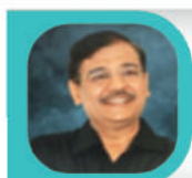
Padma Shri Ujjwal Nikam, Indian Special Public Prosecutor